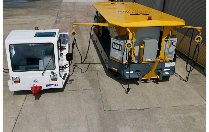
Oshkosh AeroTech Tractor & AmpCart Towable Charging Platform