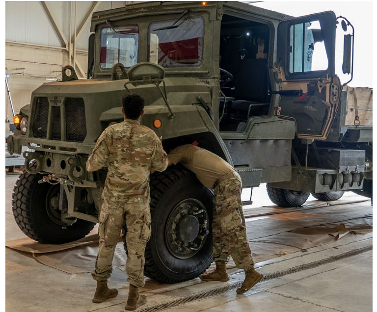
FMTV A2 LVAD Preparation for Parachute Testing