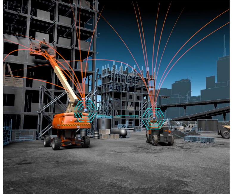
ClearSky Smart Fleet™ supports improved productivity

* Non-GAAP results. See appendix for reconciliation to GAAP results