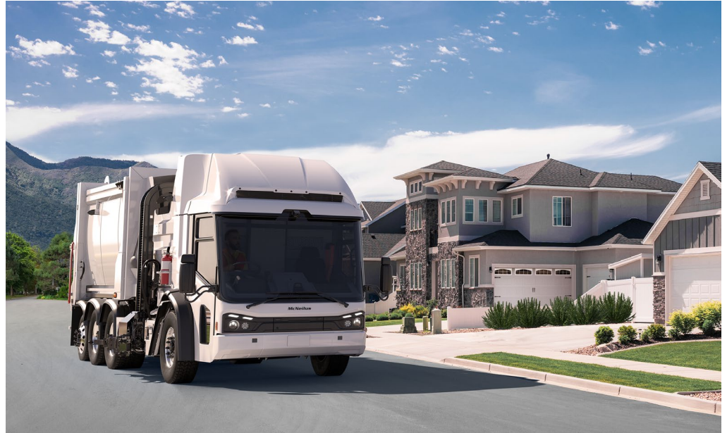
Volterra® ZSL™ Electric Refuse & Recycling Collection Vehicle