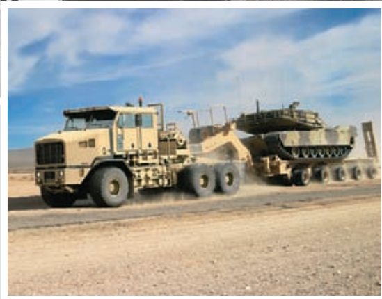
Oshkosh Global Heavy Equipment Transporter