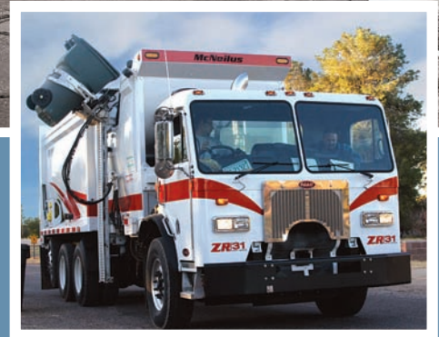
McNeilus Zero-Radius Refuse Collection Vehicle