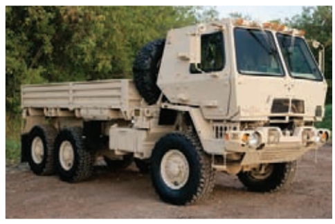
Oshkosh FMTV Cargo Variant