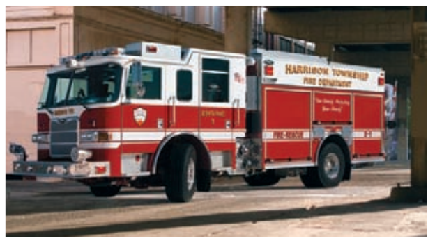
Pierce "PUC™" Heavy Duty Rescue