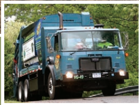
McNeilus Compressed Natural Gas Refuse Collection Vehicle