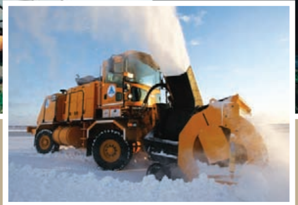
Oshkosh H-Series Snowblower