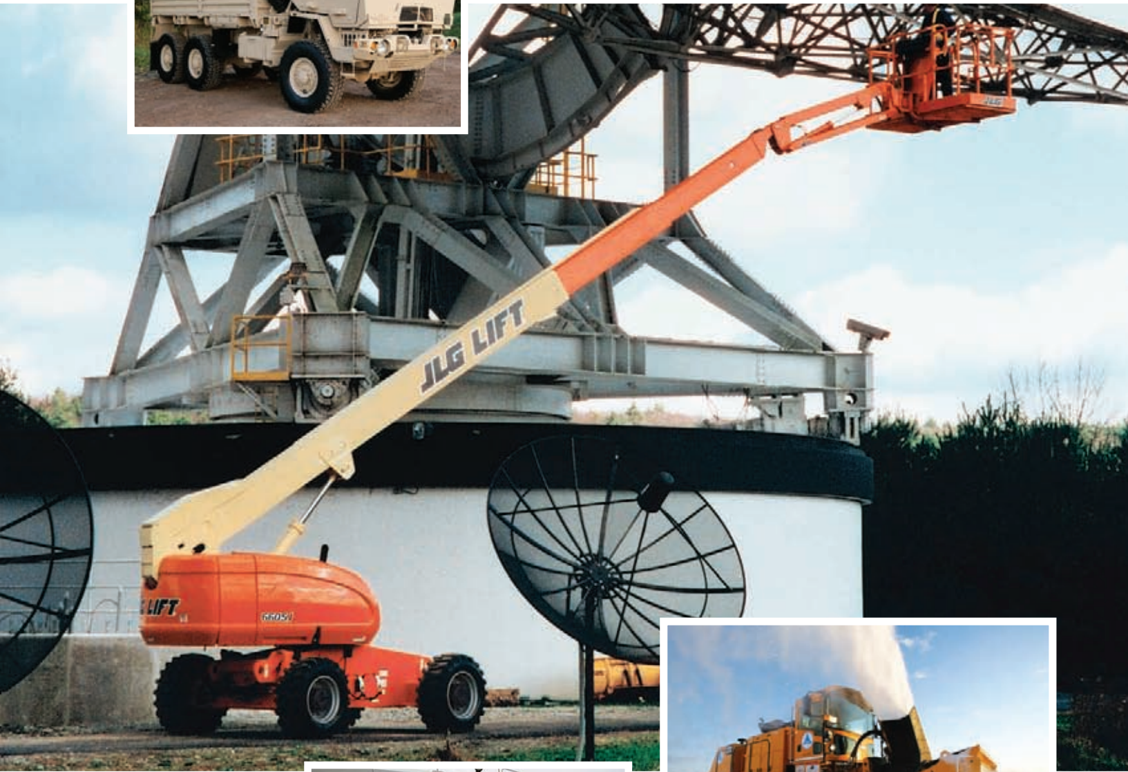
JLG Aerial Work Platform