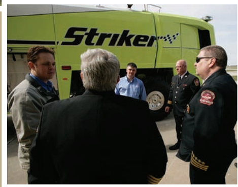
Airport fire chiefs providing input on Global Striker