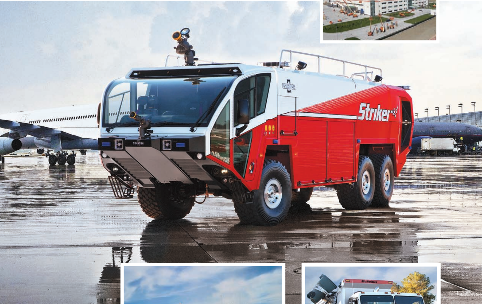
Oshkosh Global Striker ARFF