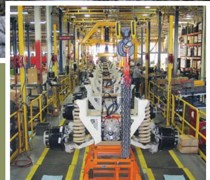
TAK-4® Independent Suspension Production Line