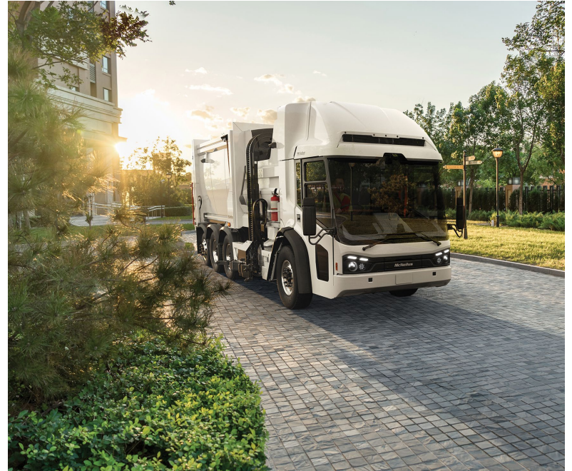
McNeilus® Volterra™ ZSL™