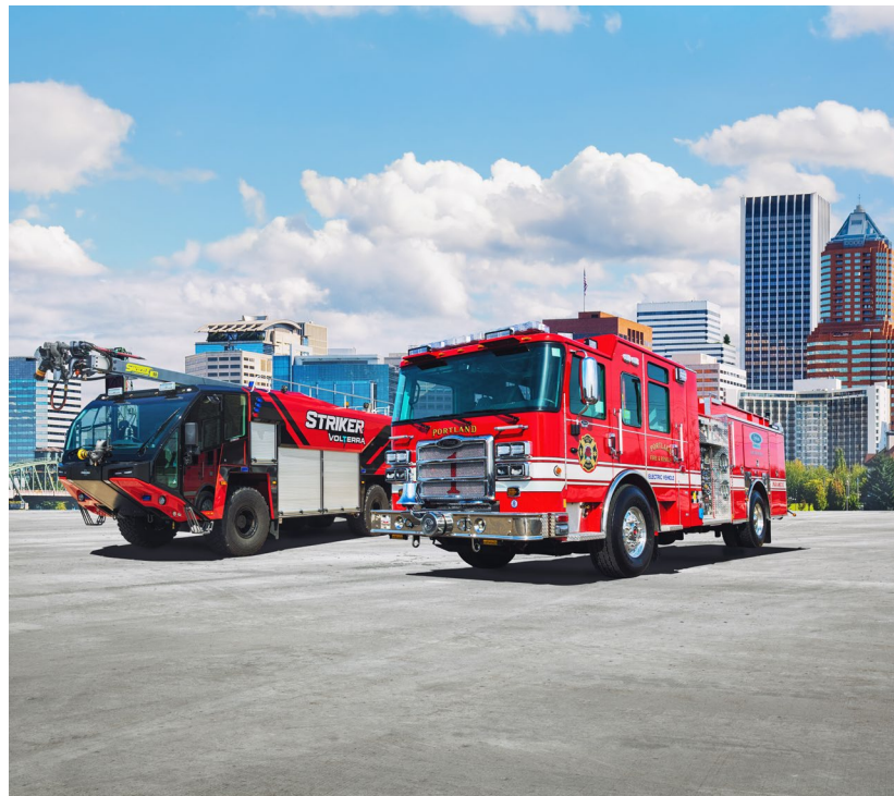
Pierce® Volterra™ Family of Electric Vehicles