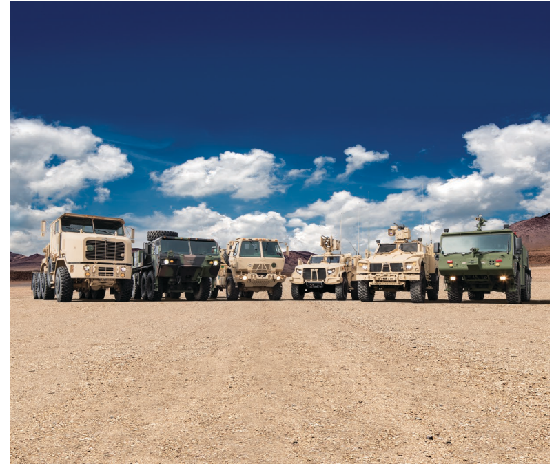
Oshkosh Defense Vehicles